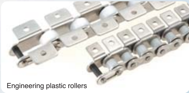
Engineering plastic rollers

Tsubaki's new LSC Series Stainless Steel Chain helps solve all of these problems!