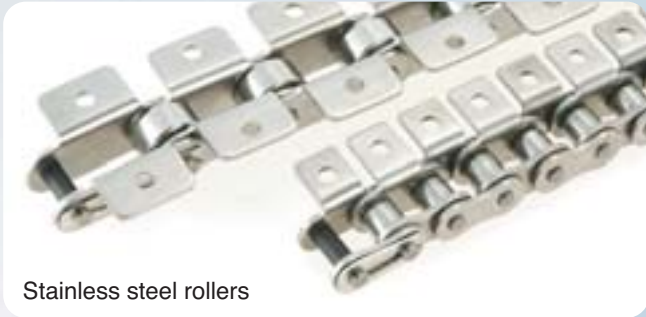
Stainless steel rollers

The LSC Series Chain with stainless steel rollers provides over four times the wear life compared to SS Series Stainless Steel Chain. Meanwhile, the increased wear resistance of the engineering plastic rollers (white) gives them over ten times the conventional wear life.